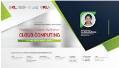
ECE_ National Webinar _ Poster.jpg 1029K

Phone No. 0863 - 2399999; www.klef.ac.in ; www.klef.edu.in ; www.kluniversity.in