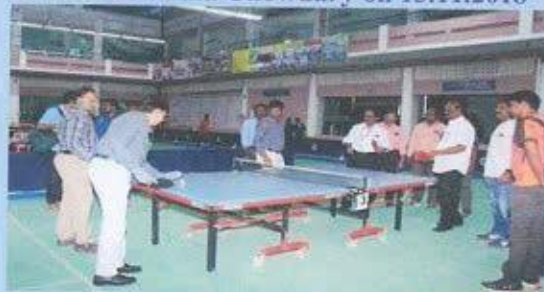
Inauguration by the Chief Guest on 13.11.2018