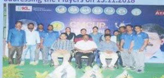
Staff group Photo with the Chief Guest and dignitaries on 14.11.2018