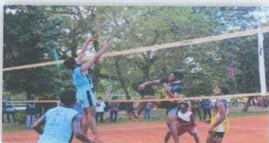
Volleyball Players in action on 23.01.2019