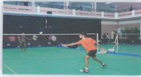
Badminton Players in action on 25.01.2019