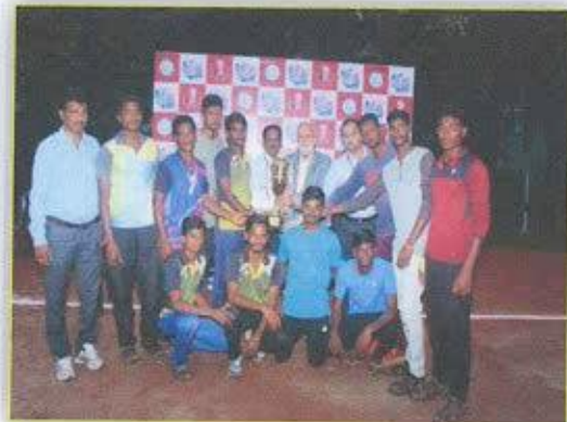
Volleyball Winners- ST. ANN'S, Chirala