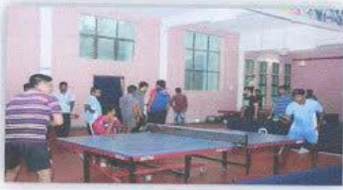
Table Tennis Players in action on 24.01.2019