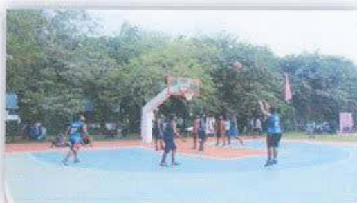
Basketball Players in action on 23.01.2019