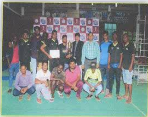
Football Winners- KLEF