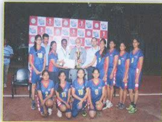
Basketball Runners- KLEF

REGISTRAR REGISTRAR Koneru Lakshmaiah Education Foundation (Deemed to be University) Green Fields, VADDESWAREM-522 302. Guntur District, Andhra Pradesh.