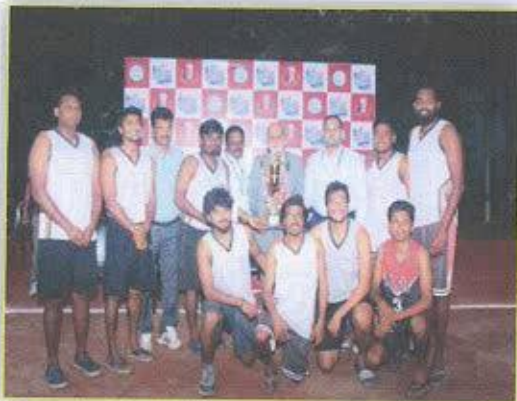
Basketball Winners- MLRIT, Hyd