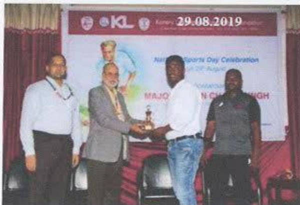
Distribution of the Prizes by the Chief Guest on 29.08.2019