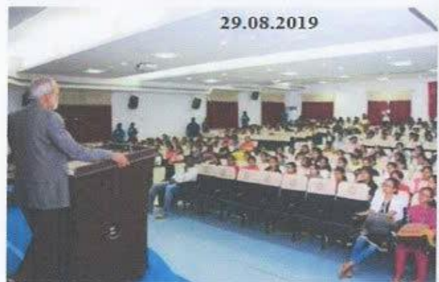
Address by the Chief Guest on 29.08.2019