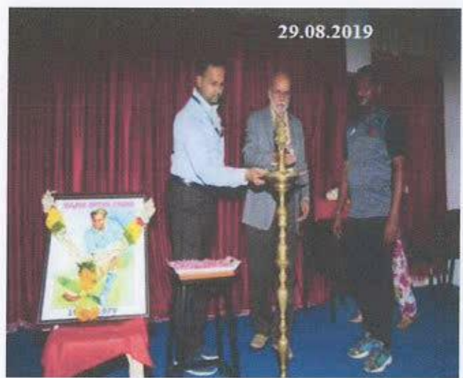
Lighting of the lamp by the chief Guest on 29.08.2019