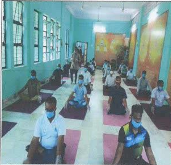
KLEF staff doing meditation on 21-06-2019