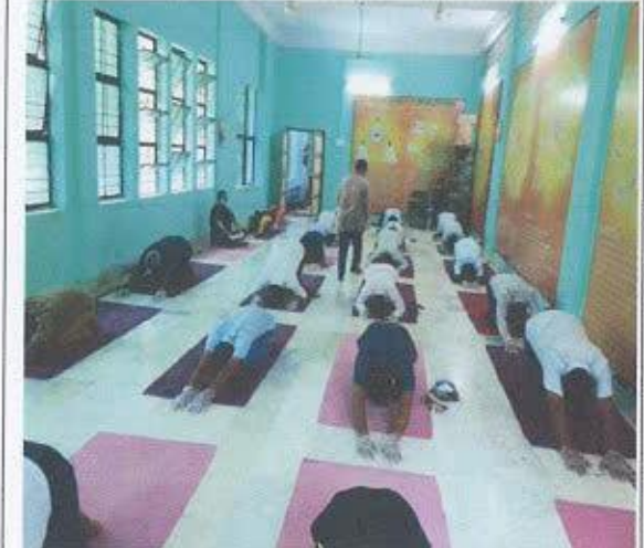
KLEF staff doing Kurmasana on 21-06-2019