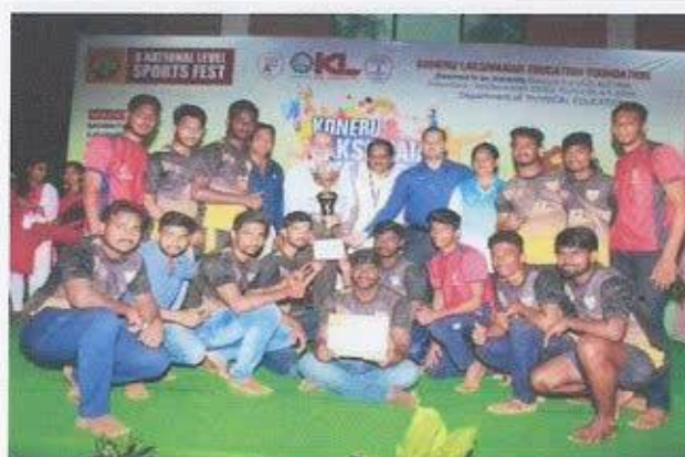
KLEF students won the overall Championship