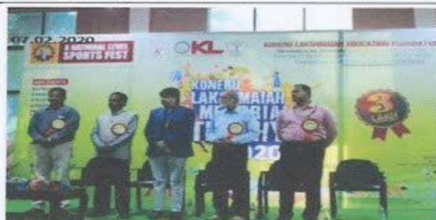
Dignitaries on the Dais during Inauguration on 07.02.2020