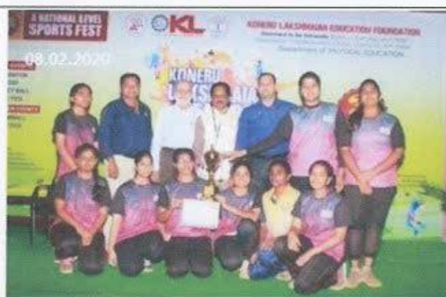
KLEF Throwball Team - Runners