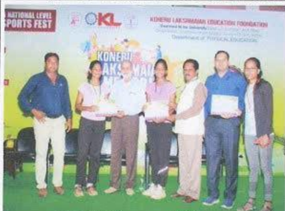
MLRIT College won Athletics medals