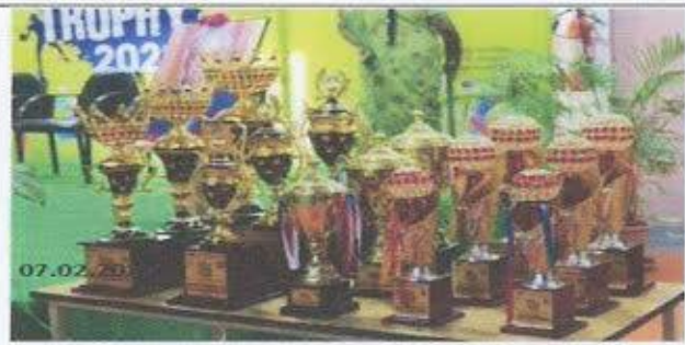
Display of the Mementos on 07.02.2020