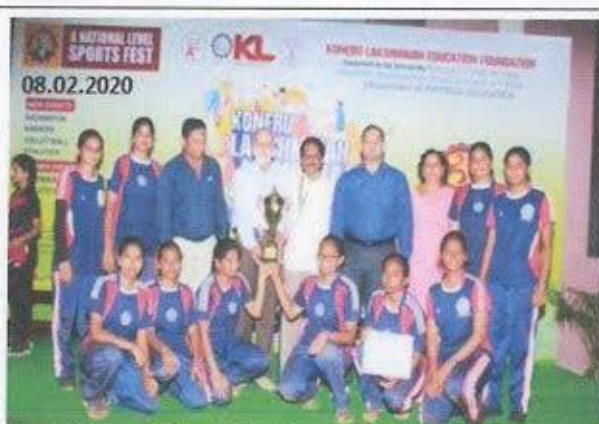
Vignan University Throwball Team-Winners