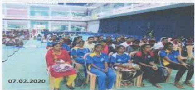
Gathering of the Players at the Event on 07.02.2020