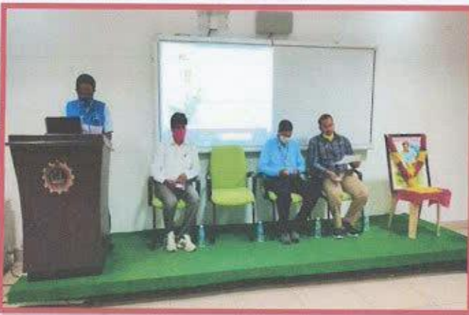
Dignitaries at the Opening on 29.08.2020