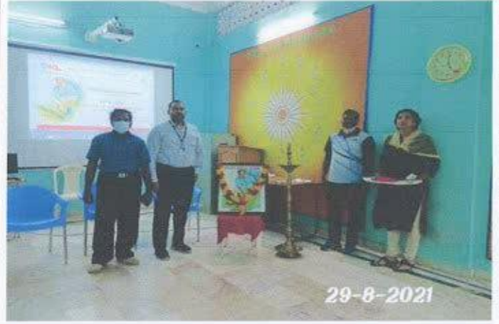
Yoga in Action on 29.08.2021