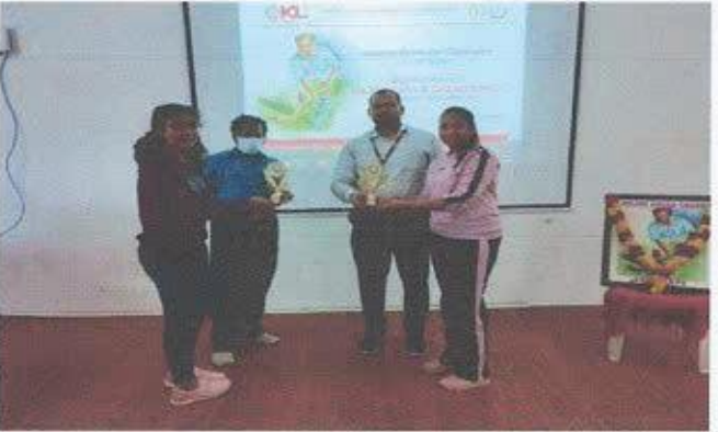
Prize Distribution during the Closing Ceremony on 29.08.2021.