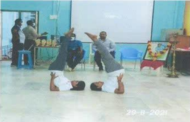
Participants Practicing Yoga on 29.08.2021.