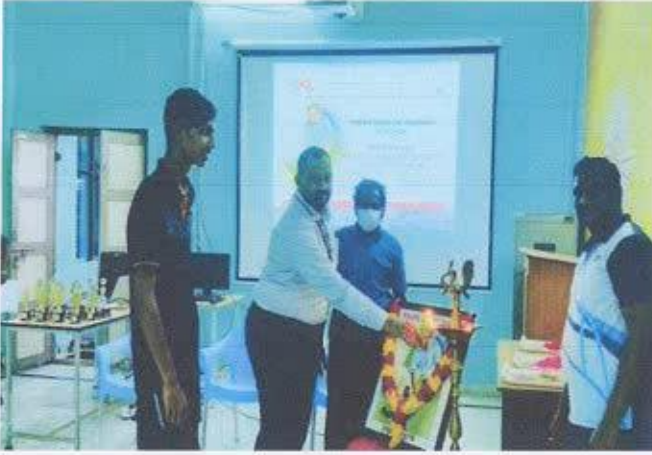
Dignitaries Present at the Opening Ceremony on 29.08.2021.