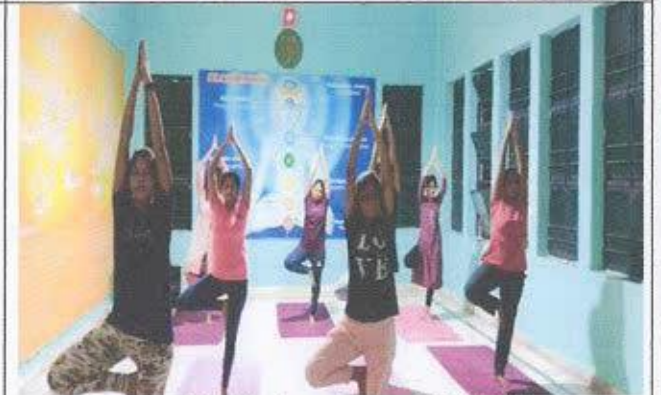
Yoga Practice in action on 05.11.2022