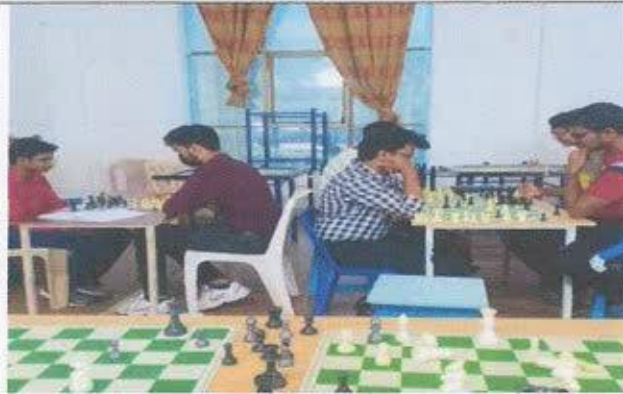
Chess at the start of play on 26.10.2022