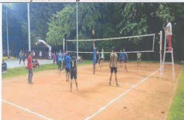
Volleyball Practice in action on 25.09.2022