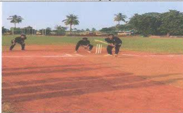
Start of cricket match on 26.10.2022