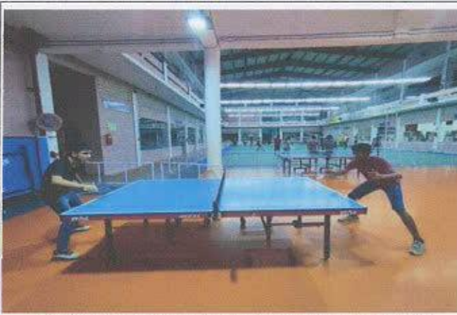
Table Tennis Men Players in action on 25.09.2022