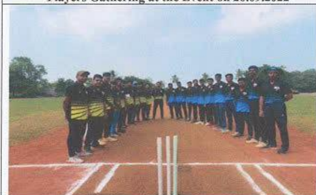
Cricket Teams at the start of the play on 21.09.2022