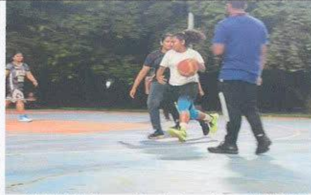
Basketball Women Practice in action on 26.10.2022