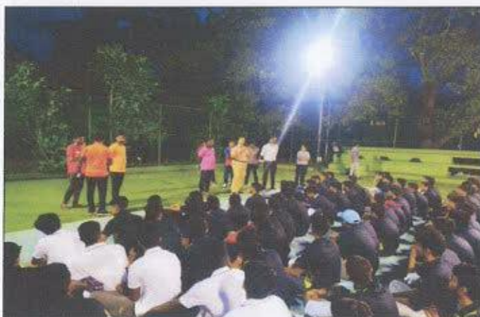
Players Gathering at the Event on 20.09.2022