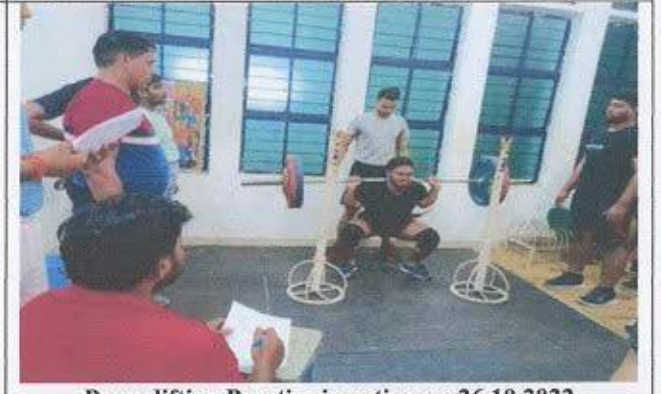
Powerlifting Practice in action on 26.10.2022