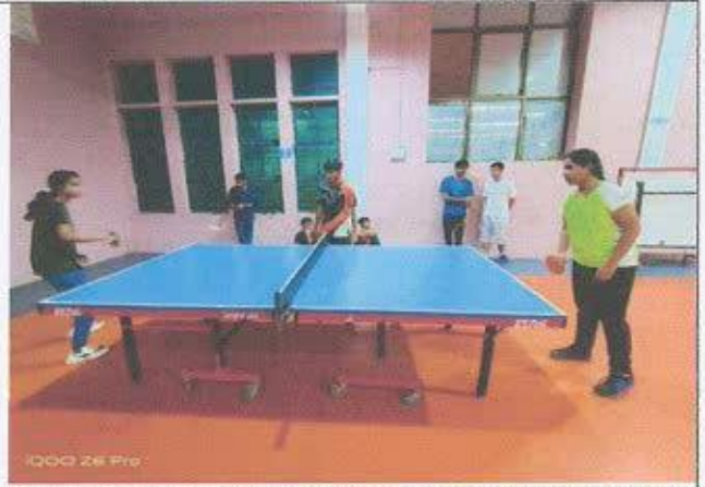
Table Tennis Women Players in Practice on 25.09.2022