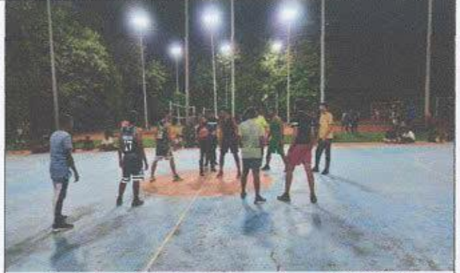
Basketball Men Practice in action on 26.10.2022