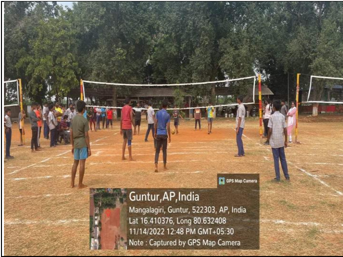
Guntur, AP, India Mangalagiri, Guntur, 522303, AP, India Lat 16.410376, Long 80.632408 11/14/2022 12:48 PM GMT+05:30 Note : Captured by GPS Map Camera