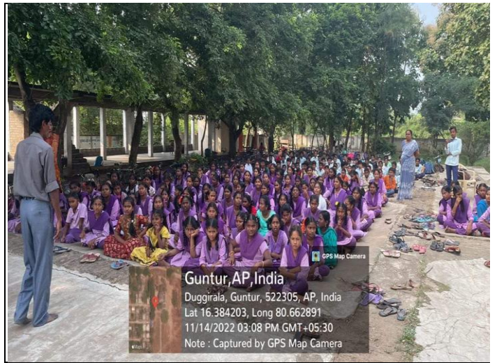
Guntur, AP, India Duggirala, Guntur, 522305, AP, India Lat 16.384203, Long 80.662891 11/14/2022 03:08 PM GMT+05:30 Note : Captured by GPS Map Camera