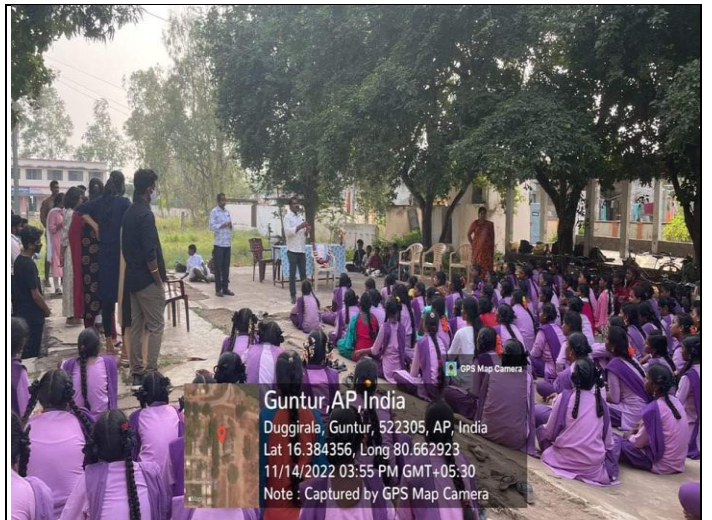
Guntur, AP, India Duggirala, Guntur, 522305, AP, India Lat 16.384356, Long 80.662923 11/14/2022 03:55 PM GMT+05:30 Note : Captured by GPS Map Camera