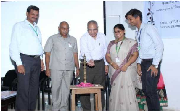
Lightening the lamp

K L University, August 23 rd 2014 – In a bid to provide insight into virtual instruments and technical computing, widely used for industry academics and research. IEEE – K L University student branch had conducted a one day workshop to introduce students about the technical software platform „MATLAB“ . The event serves as the culmination of "Connecting the basic studies done by the students and practically observing them by simulating them" and also the advantages of using this software platforms which are very helpful for them in future to implement their innovative ideas.