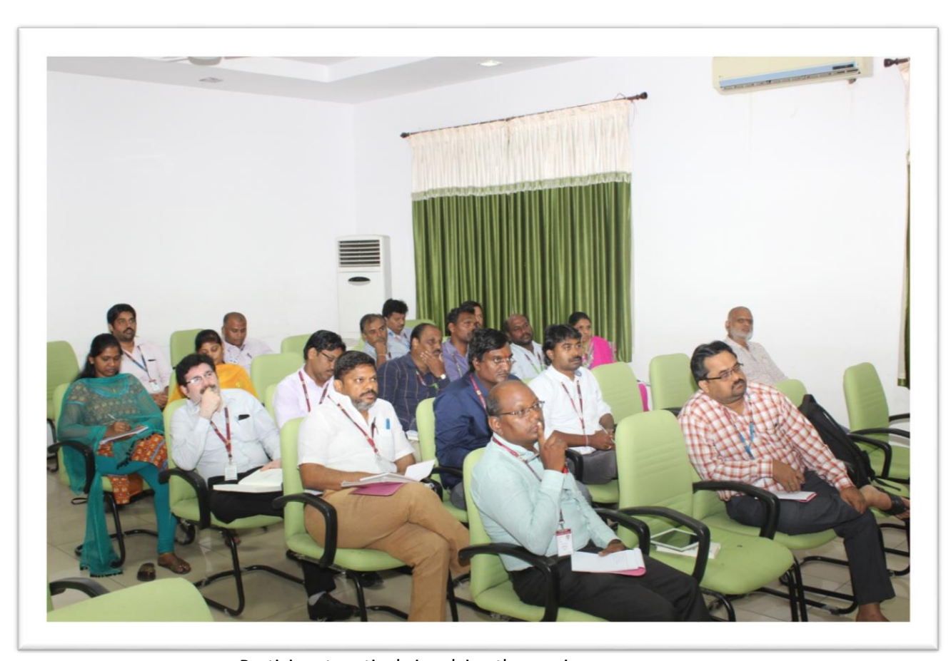
Participants actively involving the session