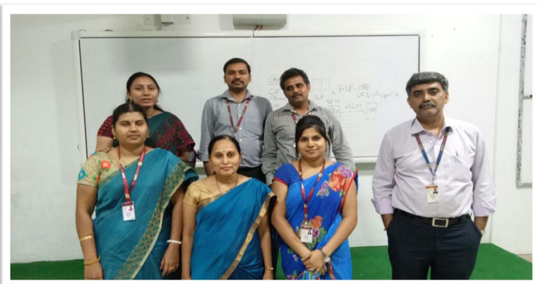
Group Photo of the Participants at the end of the Program and Certificates distribution by Resource person