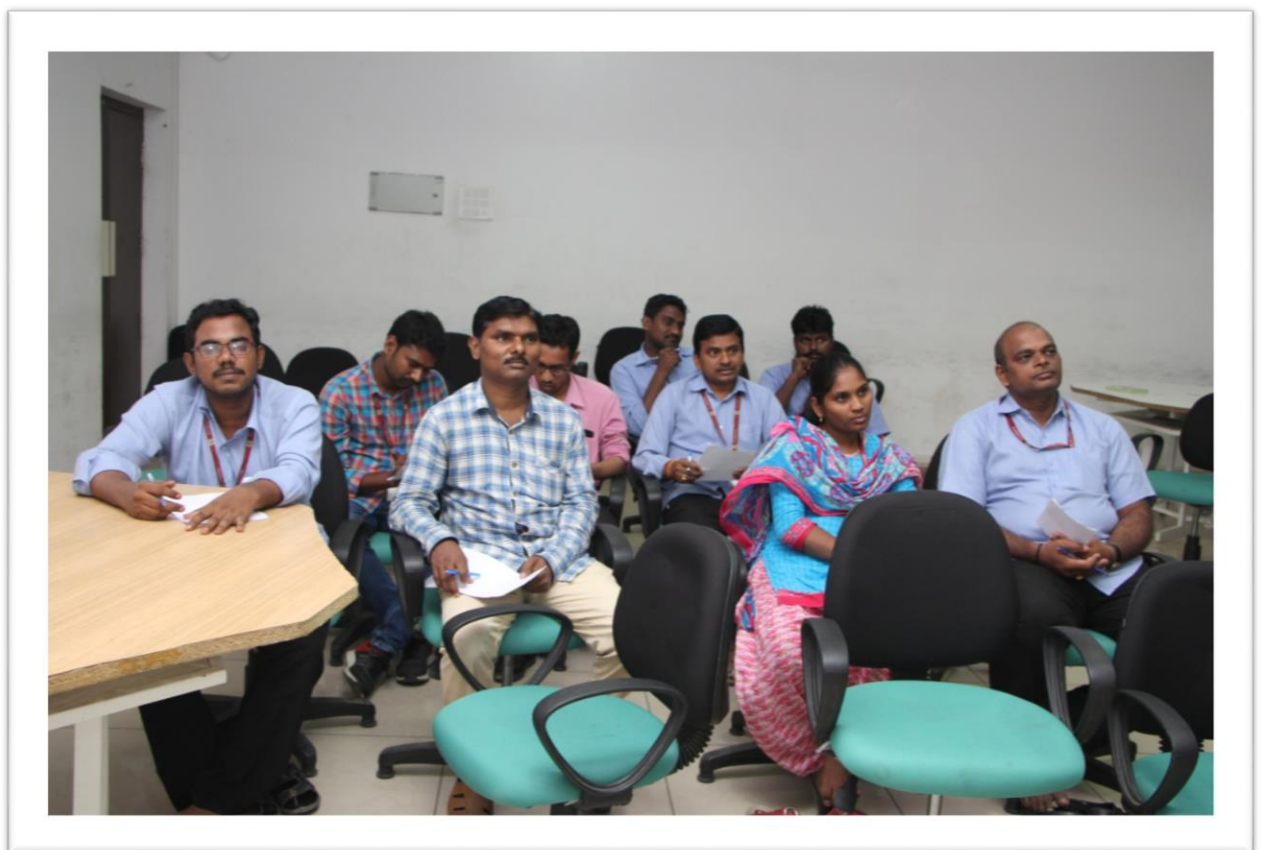
Resource Person actively involving Participants in Discussions