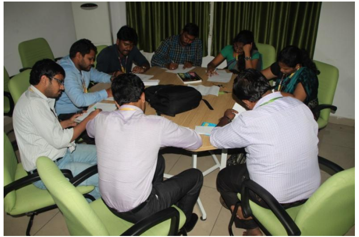
Participants working in teams to prepare and present the article keeping in view the articulation skills learned