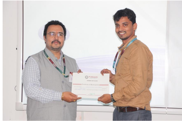
Participants awarded with participation certificate