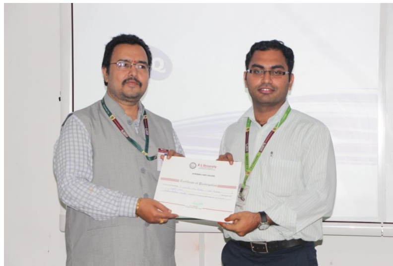
Participants awarded with participation certificate