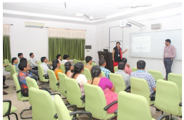
Participants enthusiastically listening to the resource person