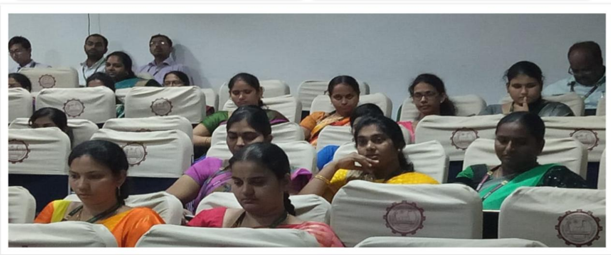
Participants actively listening