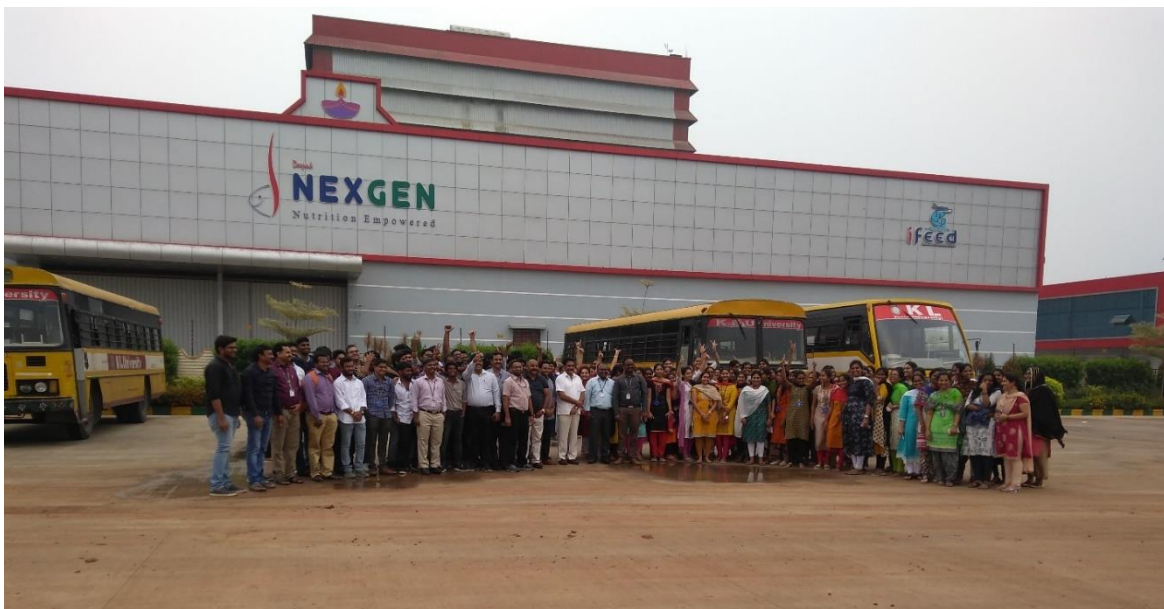
Faculty and Students at Deepak Next Gen Aqua industry

The management has offered lunch to all of us followed by a presenting their future goals by 2020. The founder of the company and CEO addressed all of us and explained their company to the micro level. The students have learnt so many things on that day especially the importance of hard work, how the company has emerged to be one of the top most companies from a small pilot lab.