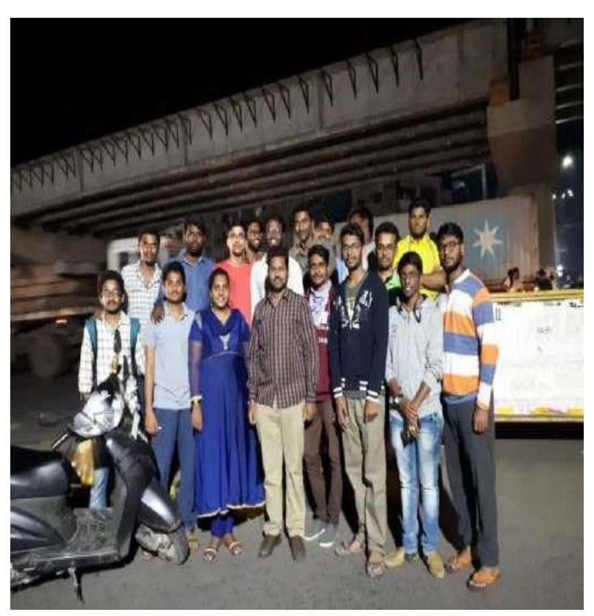
Group photo of the volunteers