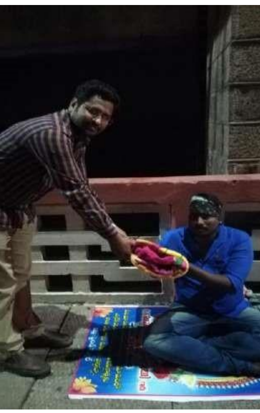
Students distributed blankets to the needy people in and around Vijayawada