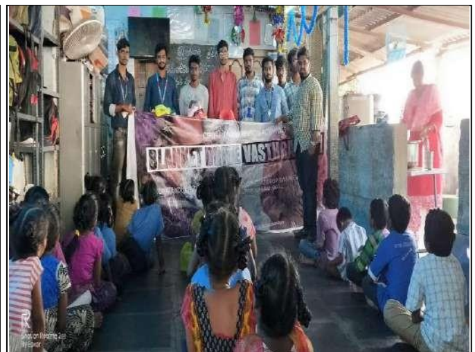
“Vasthradhan {Clothes Distribution}” in orphanages on 21/01/2019 to 16/02/2019 at Guntur & Vijayawada areas