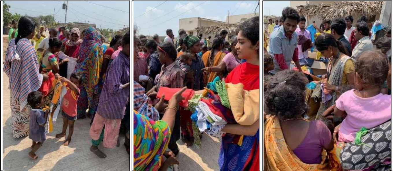
“Vasthradhan {Clothes Distribution}” in slum areas on 21/01/2019 to 16/02/2019 at Guntur & Vijayawada areas