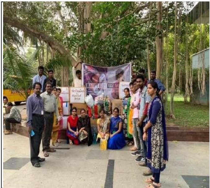
“Vasthradhan {Clothes Distribution}” on 21/01/2019 to 16/02/2019 at Guntur & Vijayawada areas