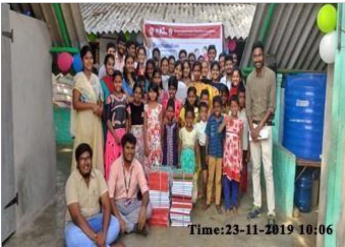
Yuvatharam Foundation- Vaddeswaram