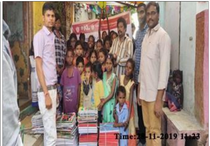
Sri Shiridi Sai Baba Anada Bala Balikala Ashramam