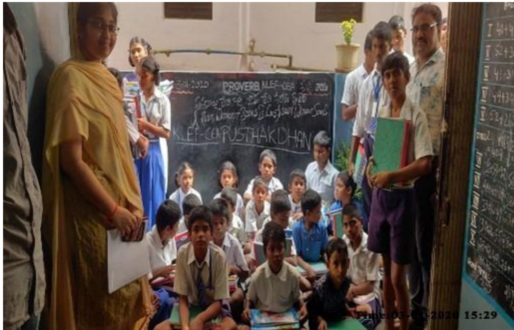
Apple Foundation, Gundala Center, Vijayawada