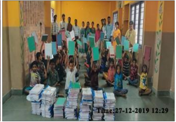
SK CV Boys Orphanage