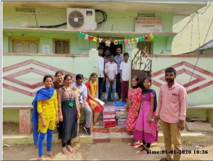
PGM Children's Home