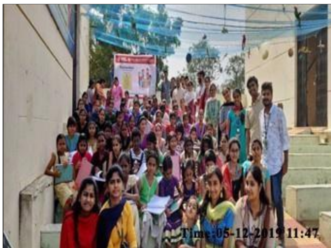
Amodini Orphanage, Kaza