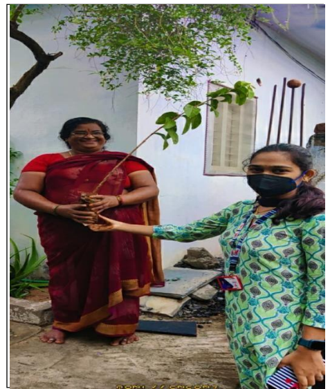
The volunteers of CEA have visited the Kolanukonda village and donated fruit bearing plants like Pomegranates, Guava etc and asked them to plant those saplings