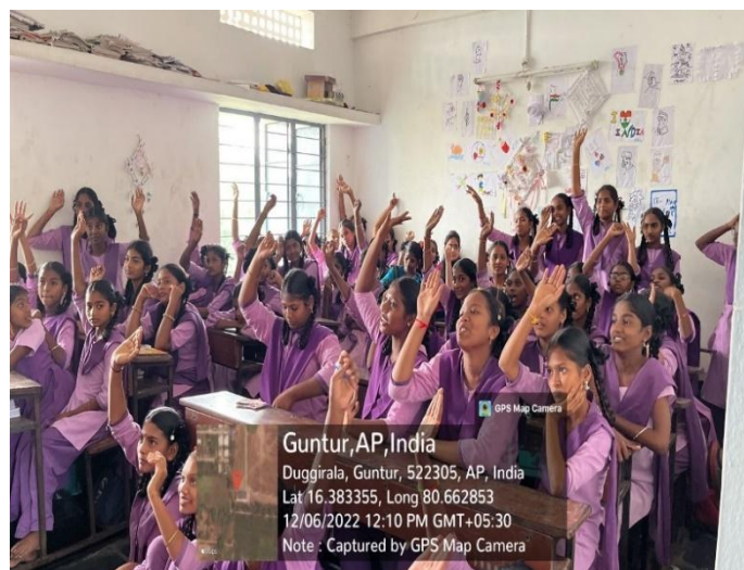
The KLEF_CEA team explained to the girl students of the Z.P, High School about the taboos of the menstruation and the measures to be taken.