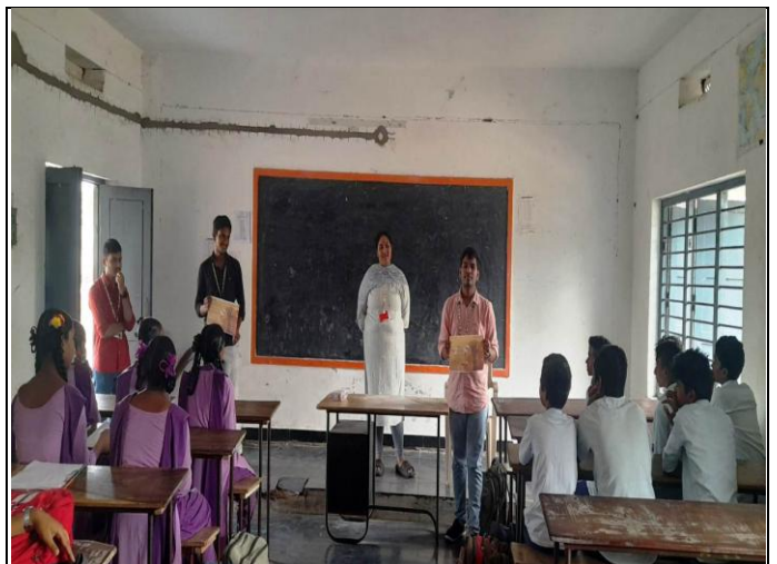
The KLEF_CEA explained to the students about their human rights with the glimpse. And what are the rights they have and how to gain them.