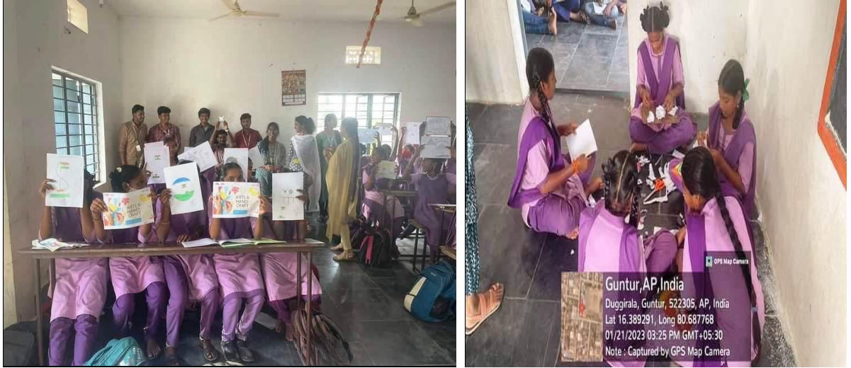
The KLEF_CEA team conducted an arts & amp; crafts to the students and the students explored their skills and prepared the crafts with the help of KLEF_CEA volunteers.