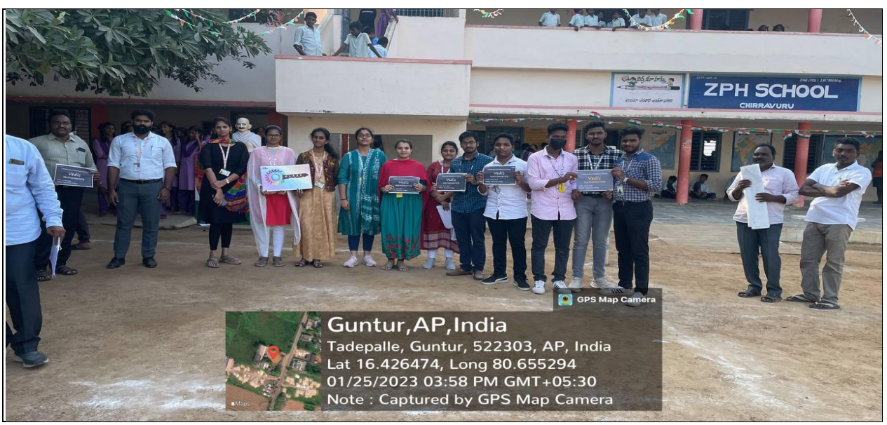
Students assembled during the Event at ZPHS School, Chirravuru Village