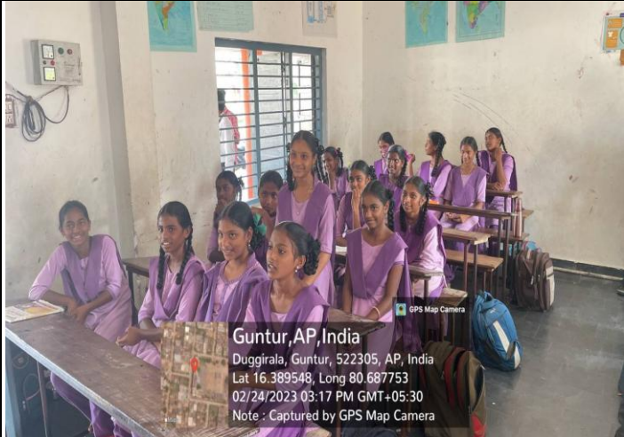
We interacted with students and shared awareness about of legal awareness it can help the students to recognize their civil, political, social and cultural rights