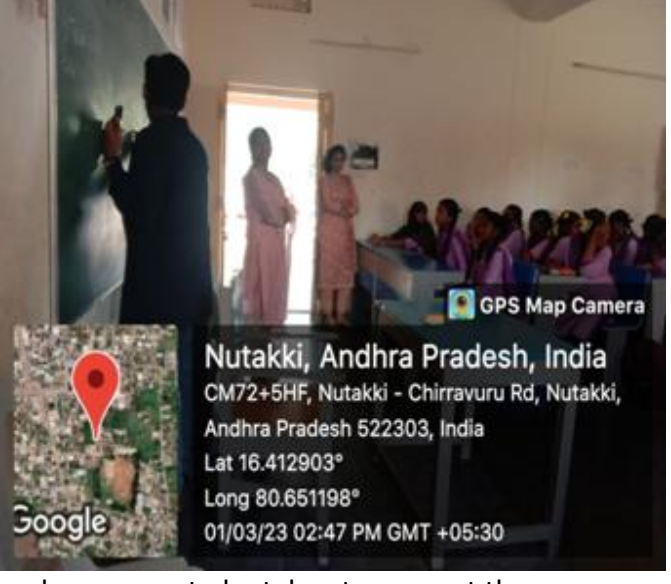
The KLEF_CEA team explained about anti drugs and measures to be taken to prevent them and the effect it will cause to the health to the students and interacted with the students.