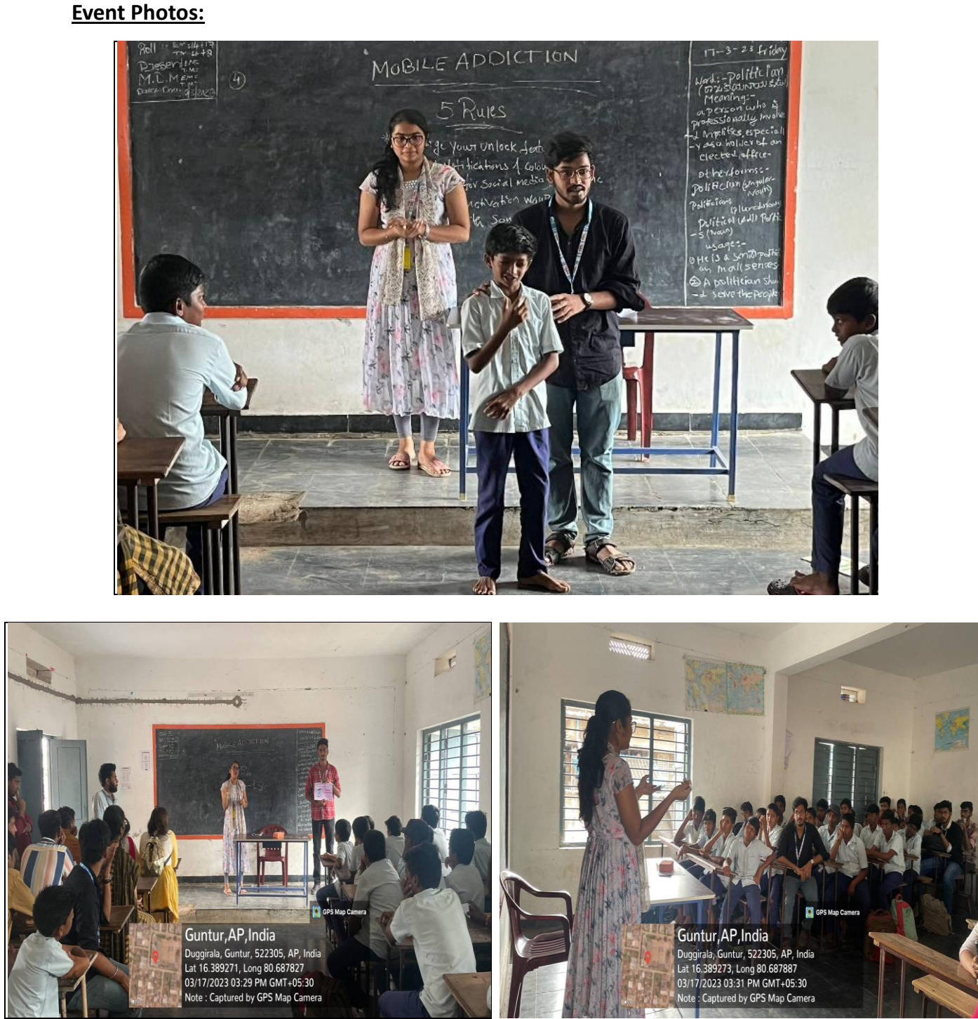
Team KLEF-CEA organized an event called "Mobile Addiction" at Z.P. High School, Pedda Konduru village, with the main objective of creating awareness about mobile addiction among students.