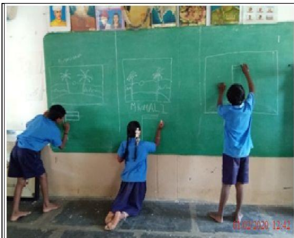
Drawing competition held among the primary school students