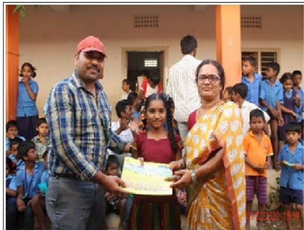
Prizes were distributed to winners of the games by mechanical, civil faculty and teachers of the primary school.