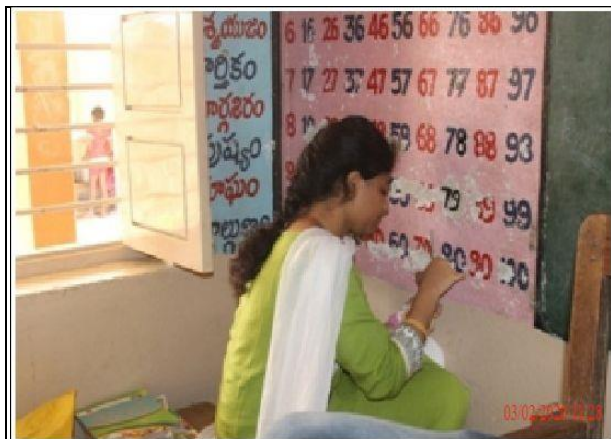
Painting of discoloured numbers in the class room