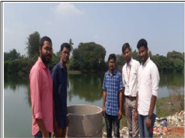
Water curing a brick of wall surface by civil students, arranging waste storage (RCC) cement dust bins