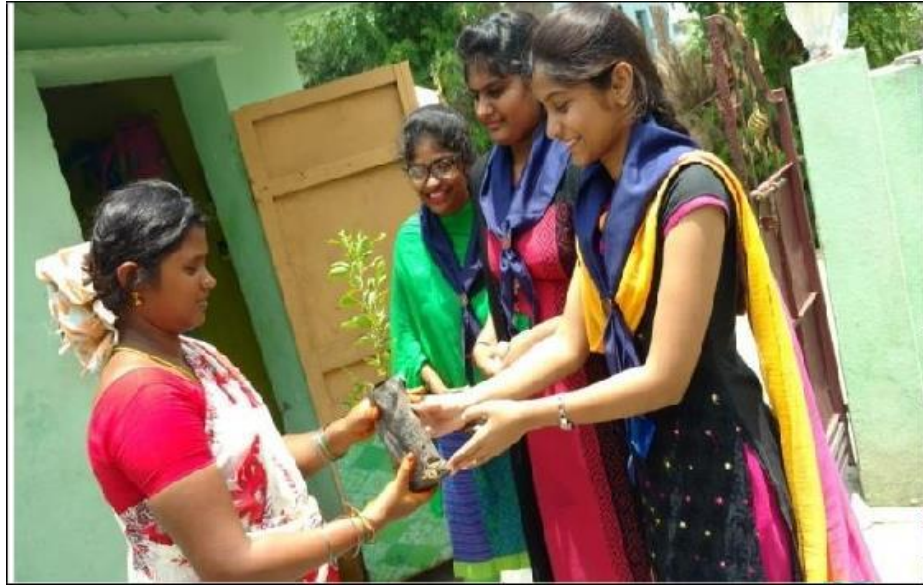
Volunteers are distributing the plants on 17-08-2018

Some of our Volunteers had visited every house and distributed saplings and made them aware of the importance of trees and adverse effects of deforestation. Most of the villagers showed a great interest in planting trees and they gave an assurance that they will take care of them.