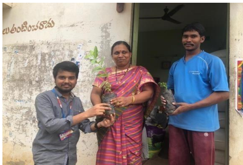
Volunteers are distributing the plants on 17-08-2018

Some of the villagers interacted with the volunteers and shared their feelings and problems with them. Our volunteers listened to their problems and made them feel comfortable to make them happy by giving a hope that they will pass all the problems in the village to the Panchayat & Govt. to take necessary actions to solve the problems in the village.