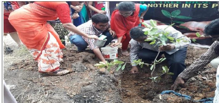
Plantation (All volunteers and panchayat members also participated on 24-09-2018)