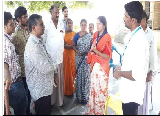
Discussion with the Panchayat members on 24-09-2018

(Program officer of the Unit-7, coordinators, special officer of gram Panchayat, villagers)