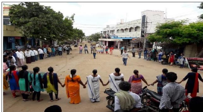
Chanting slogans at main center of village on 24-09-2018

(Program officer of the Unit-7, coordinators, special officer of gram Panchayat, villagers)