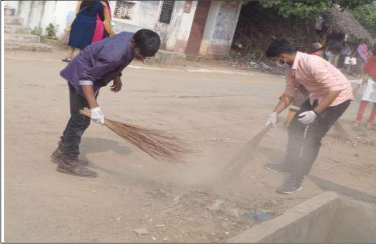
NSS Volunteers Cleaning the bus stop on eve of Swachh Bharat on 05-01-2019.