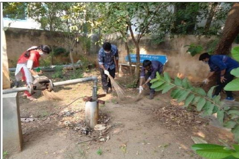
Students Cleaning the park area in Prathuru on 05-01-2019