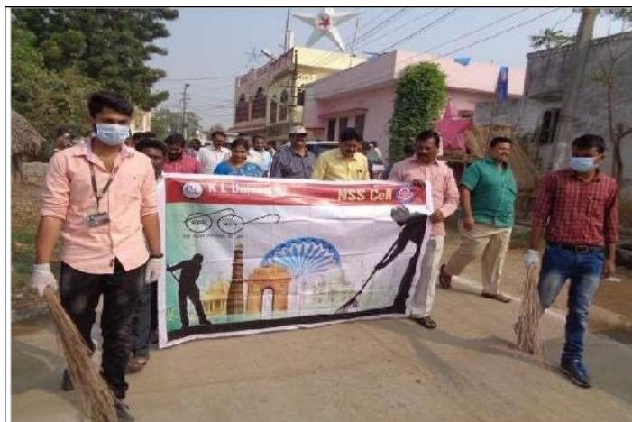
Rally on Clean Roads participated Panchayat Secretary and officials, Volunteers on 05-01-2019.