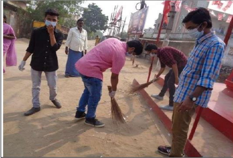
NSS Volunteers Cleaning the Roads on eve of Swachh Bharat at Prathuru