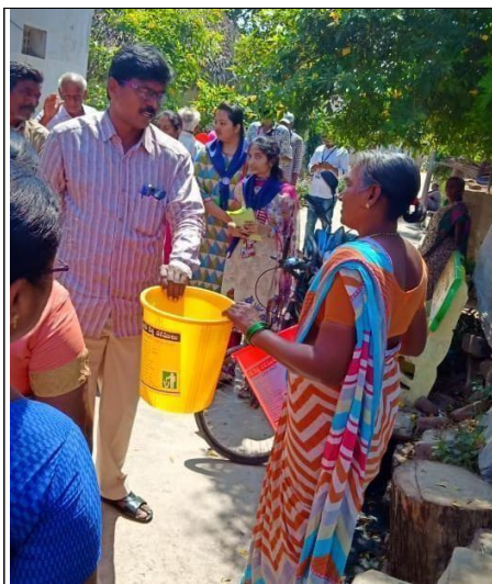
Program Officer and panchayat secretary distributing dustbins to villagers