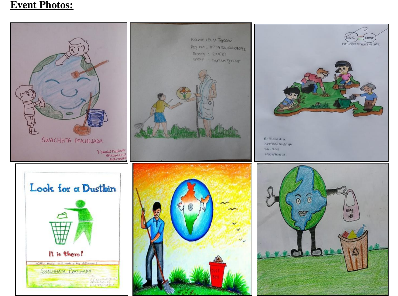
No. of students participated: 72

22(A) Tenali battalion, NCC UNIT, KLEF carried out these drawing and essay writing competitions on 14th December in the event of SWATCHATA PAKHWADA and acquired the good knowledgeable concept of life such as importance of cleanliness. Cadets participated in bustling way by giving their essays and arts. In this pandemic, NCC UNIT, KLEF capitalized the event in prolific way. This event enhanced the cadets' concentration and eye to hand coordination, fine motor skills.