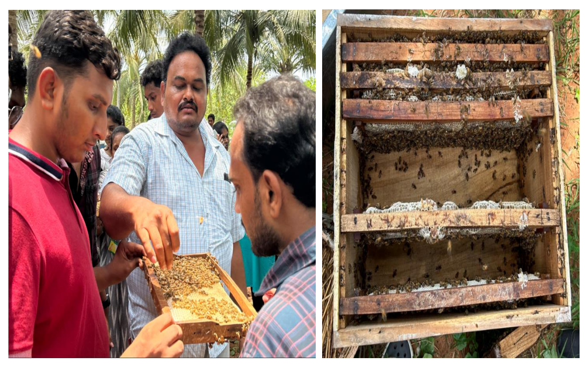
Observing the bees and frames in the bee hive