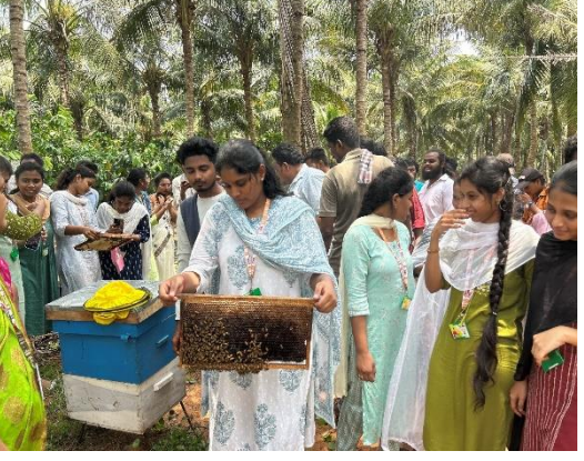
Students observing the different bees in the bee colony