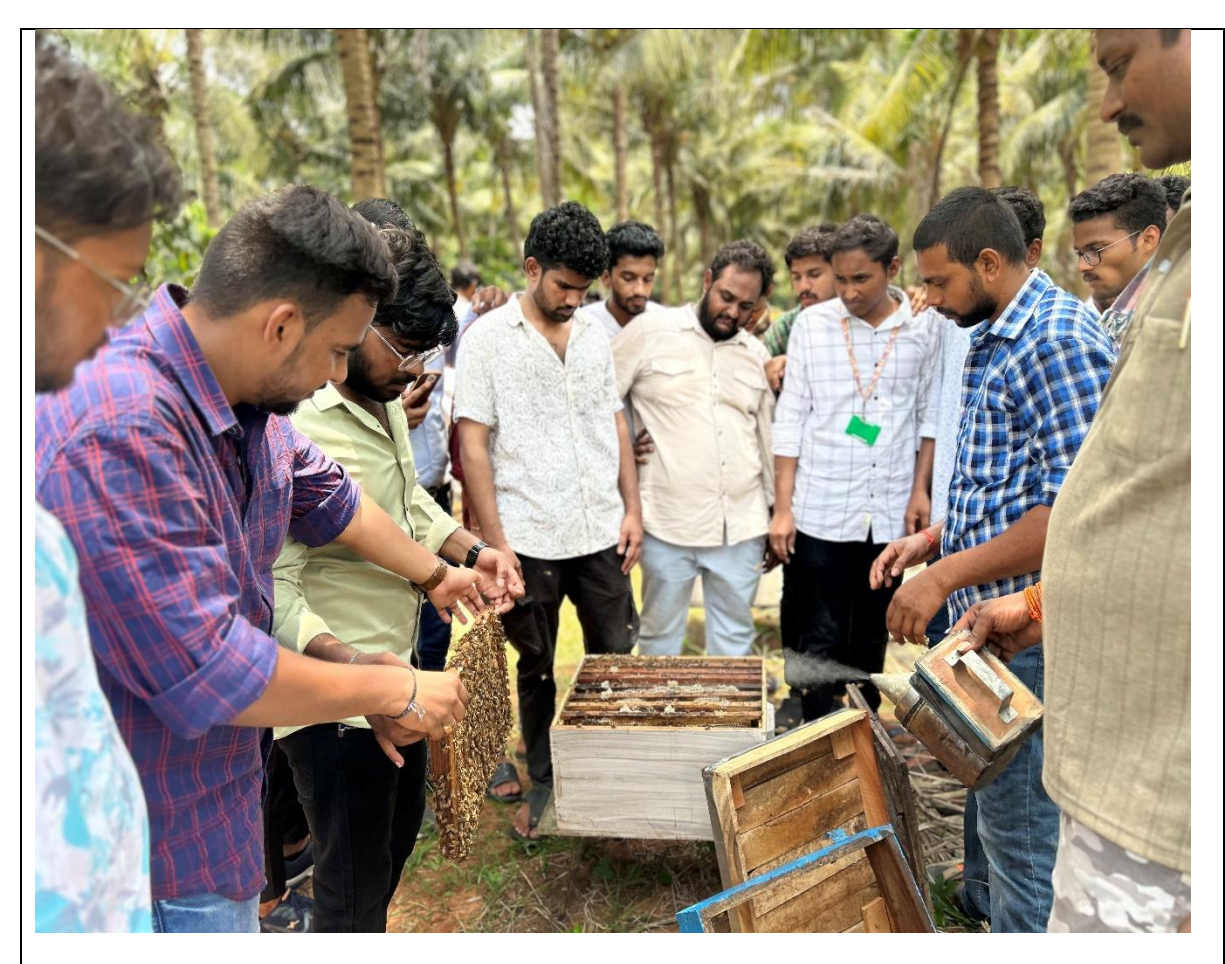
Smoking the bees by using smoker