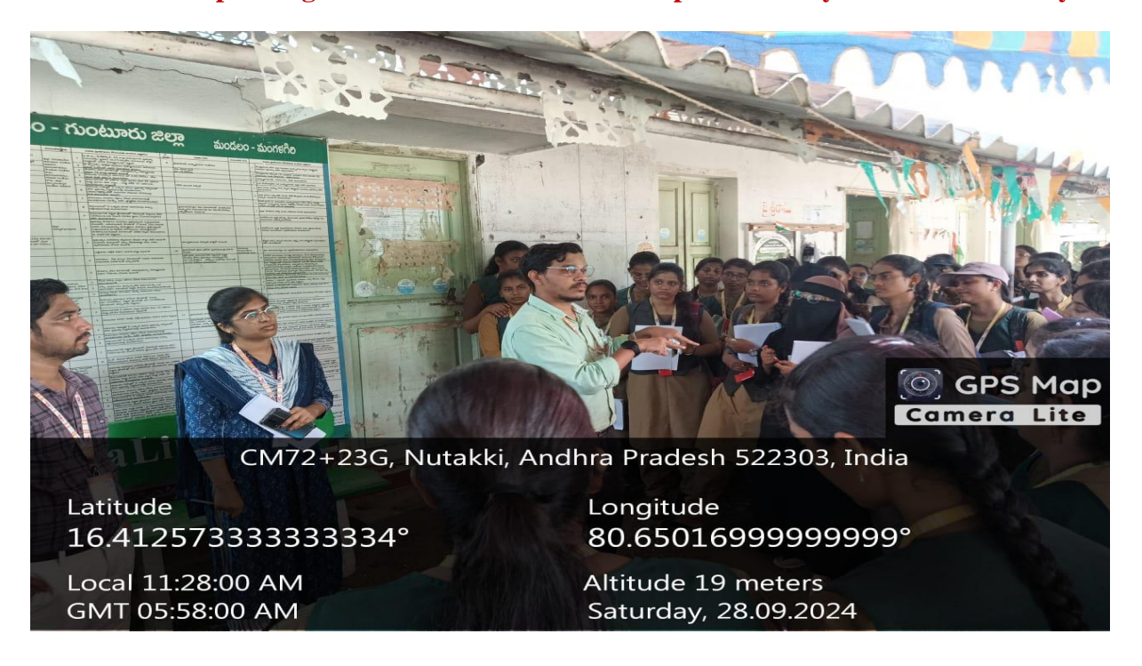
Faculty is Describing Panchayat Raj System to Students