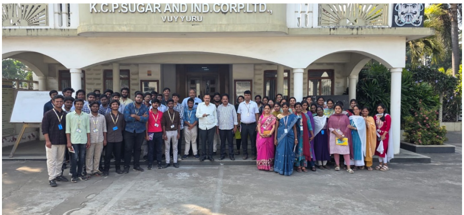
KCP Sugar Industry office

Overall, the industrial visit was highly beneficial in providing practical exposure, fostering industrial awareness, and enhancing the professional outlook of students.