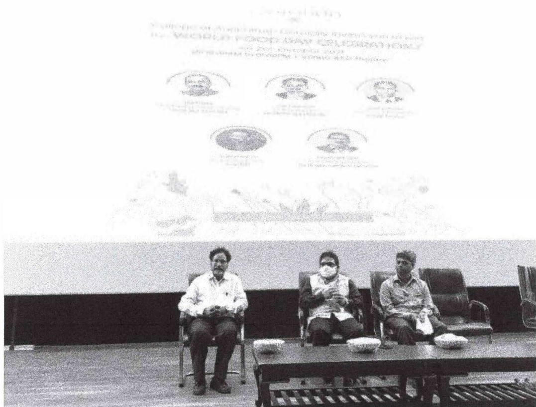
World Food Day Celebrations in R&D Theatre on 22.03.2021