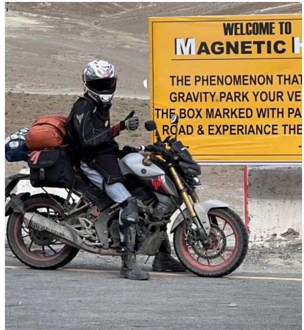
Record Breaking Ride-Business Analytics Student Conquer the Himalayas