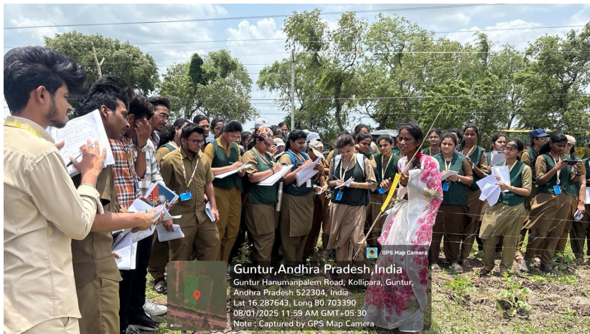
Farmer explaining about models of natural farming