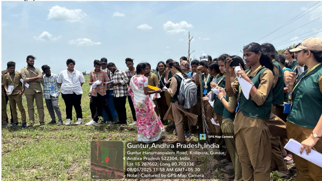
Farmer explaining about natural farming