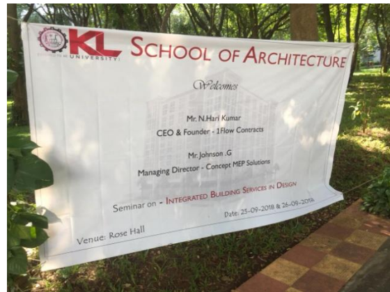
Welcome Banner for the experts