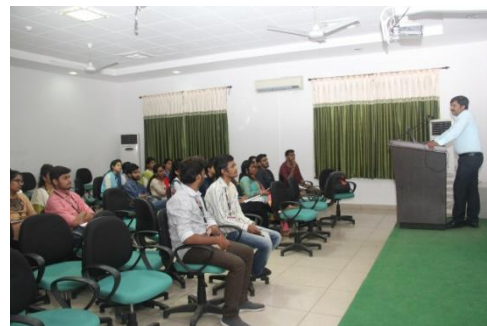
Day 1-Students and faculty present at the seminar