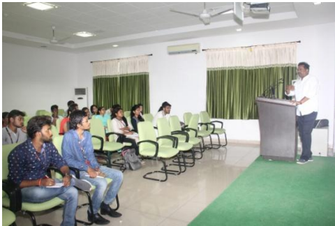
Day 2-Students and faculty present at the seminar