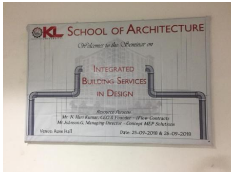
Banner of the event