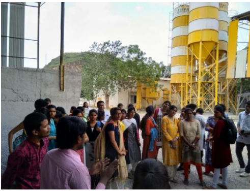
On site explanation of the working of RMC plant