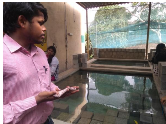
Expert explaining the students about the sample testing and curing