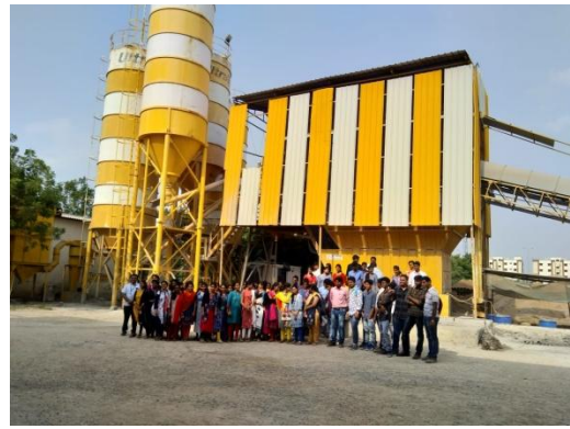
Students along with the faculty and expert at the Ultra Tech - RMC plant