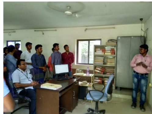
Expert giving orientation to the students about the RMC plant