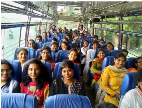
Journey to the visit

As a part of academic curriculum the students of 2 nd , 3 rd and 4 th years of School of Architecture have been taken to the “ Ultra tech – Ready Mix Concrete Plant ”. The students were provided an onsite insight of the process, working of the machinery and various testing tools and market demands. The site visit covers the subjects of Building Materials, Building construction – IV and Advanced Building Construction and Materials helping them for a better understanding.