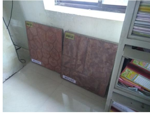
Display of samples – various types of concrete blocks