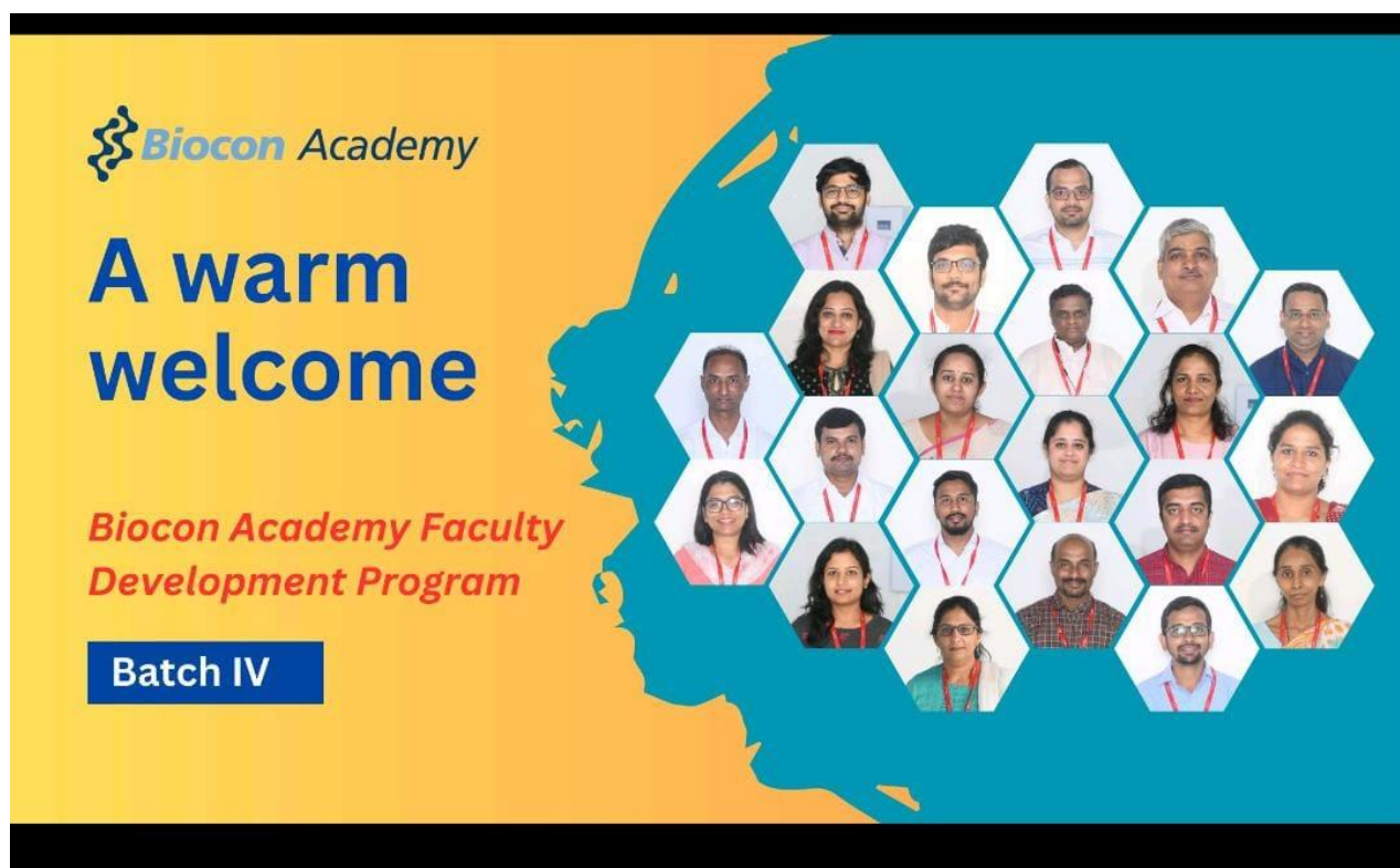
Participants of Biocon certificate Program in Faculty Development