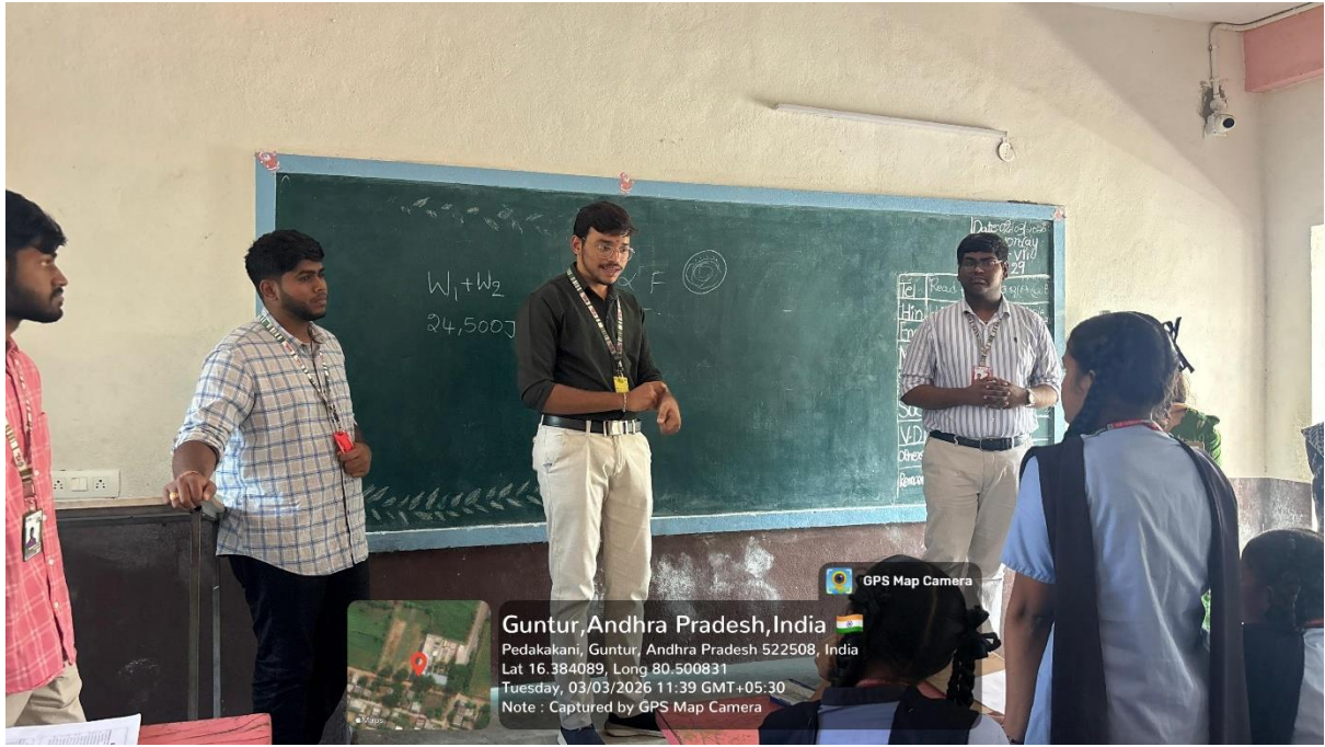
Guntur, Andhra Pradesh, India 🇮🇳 Pedakakani, Guntur, Andhra Pradesh 522508, India Lat 16.384089, Long 80.500831 Tuesday, 03/03/2026 11:39 GMT+05:30 Note - Captured by GPS Map Camera