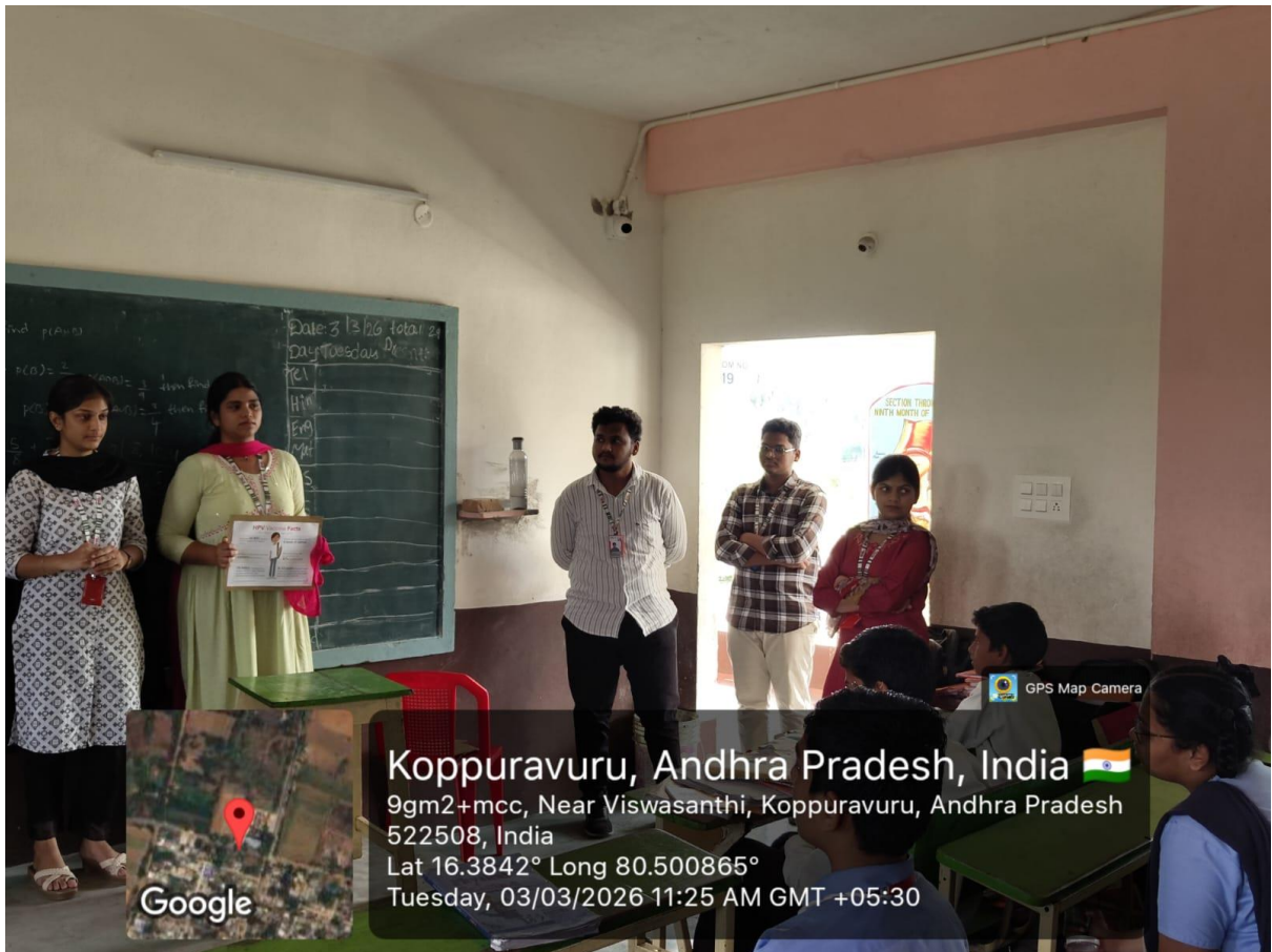
Koppuravuru, Andhra Pradesh, India 🇮🇳 9gm2+mcc, Near Viswasanthi, Koppuravuru, Andhra Pradesh 522508, India Lat 16.3842° Long 80.500865° Tuesday, 03/03/2026 11:25 AM GMT+05:30