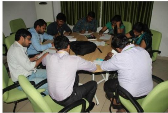
Participants working in teams to prepare and present the article keeping in view the articulation skills learned