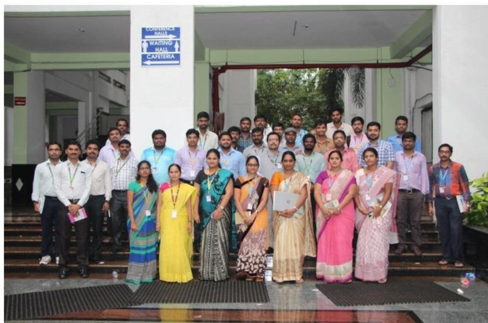
Group photo of the participants for the 1-day session on “Articulation Skills”