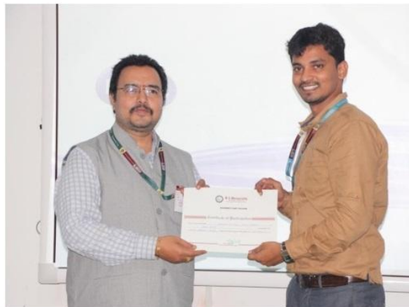
Participants awarded with participation certificate