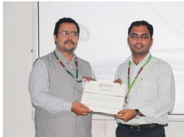
Participants awarded with participation certificate