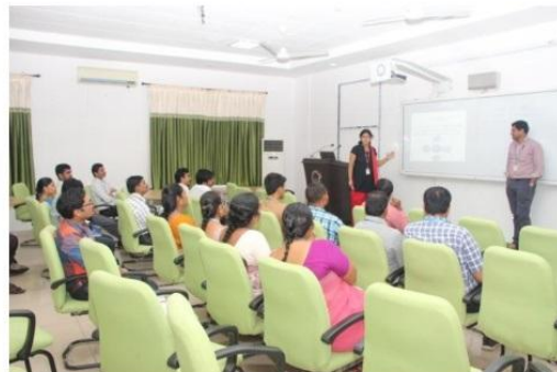
Participants enthusiastically listening to the resource person