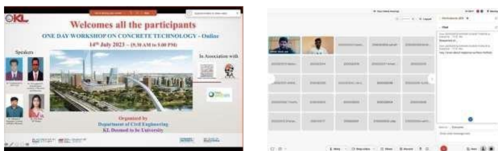
Fig 1: Welcome slide, Total Number of Participants