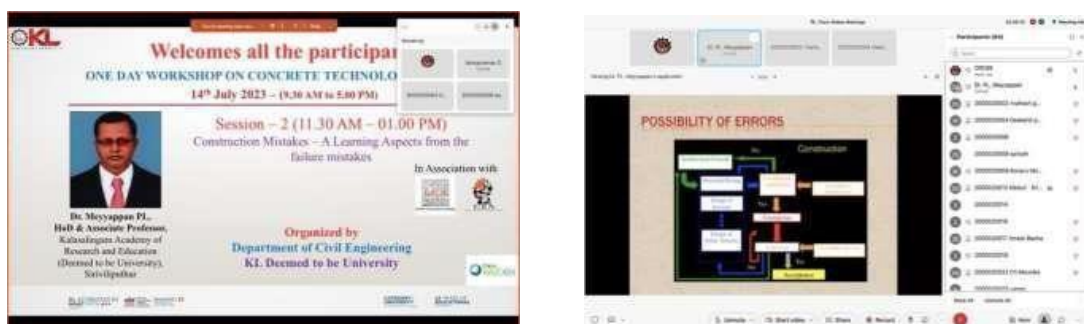
Fig 3: Speaker 2 - Introduction on session and Possibility of Errors