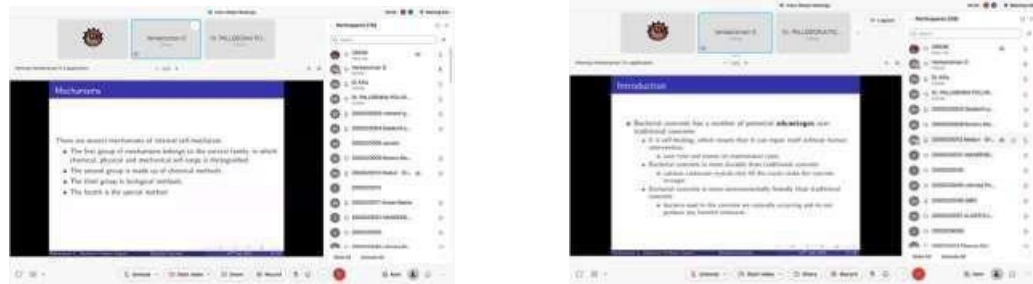
Fig 2: Speaker 1 - Introduction on session and Mechanism