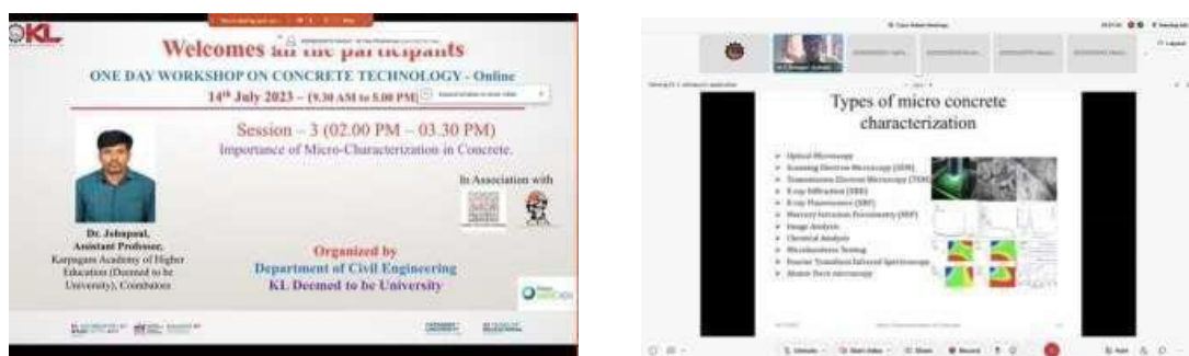
Fig 4: Speaker 3 - Introduction on session and types of micro concrete characterization.