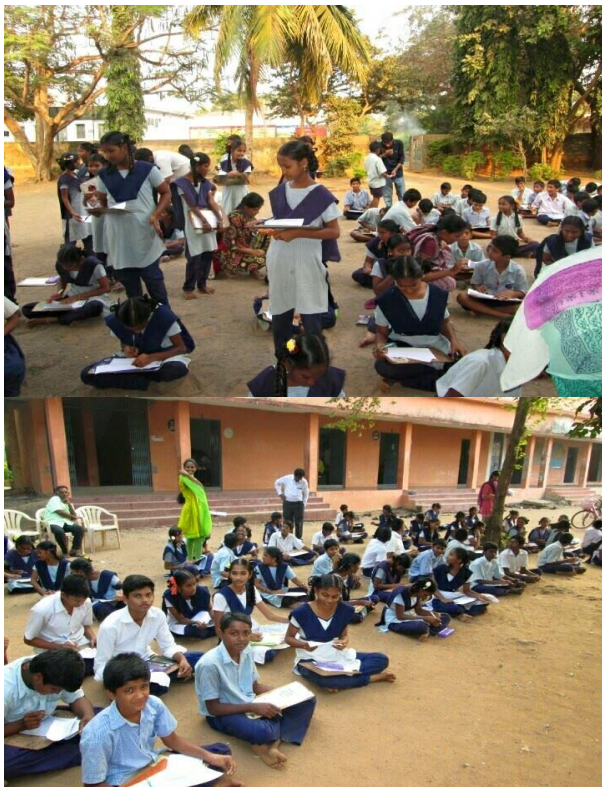
Students participating Pazzle Mania event