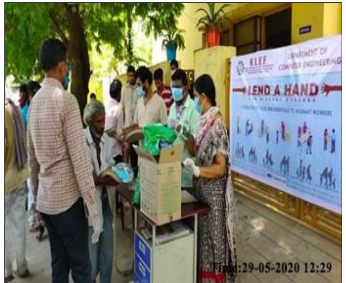
Dept of ECM has distributed food and essentials to the migrant workers