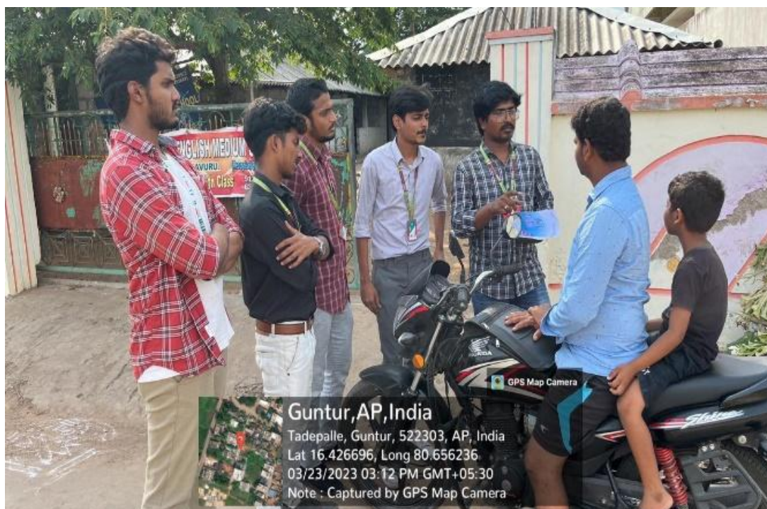
KLEF_CEA team members creating awareness among the people regarding effects of soft drinks and how they harm us.