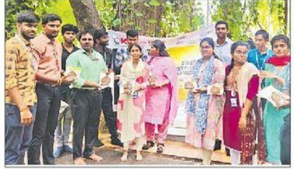
మట్టి విగ్రహాలు పంపిణీ చేస్తున్న కేవల్ యూ విద్యార్థులు